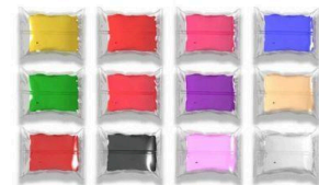
12 Air Dry Clay Pouches