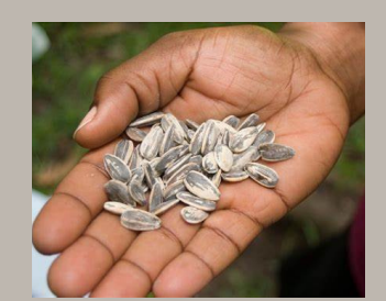
Best F1 Hybrid seeds in India