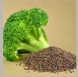
Hybrid vegetable Seeds